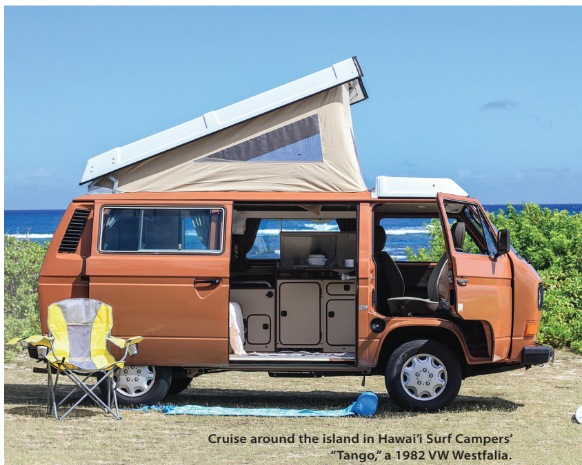
Cruise around the island in Hawai'i Surf Campers' "Tango," a 1982 VW Westfalia.

With so much to see and do on O'ahu, it's hard to pinpoint them all and then attempt to jam-pack the activities into a single vacation. Sure, "backpacking" through a new place can be fun but what if your day is wasted on just trying to walk to your next adventure? Although it's fun to explore by foot, traveling by wheels can be just as invigorating. O'ahu's summer-like weather will also help enthrall the senses as you take in the many sights and sounds throughout the island. Here are the top five "wheelee" fun activities to try out while on the island. From a dance party aboard a tricked-out, 25-passenger bus and retro accommodations in a 1970 VW Riviera to a pedal crawl to the island's favorite bars and off-road adventures on a ranch, O'ahu's got the best wheels of fun from which to choose.